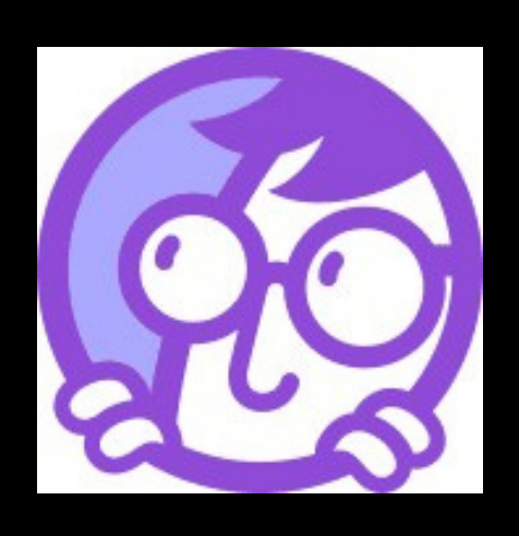
PickyStory: For Upselling Products