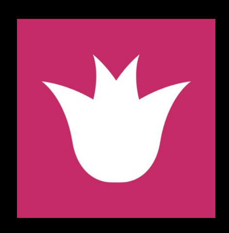
WideBundle: For Product and Price Bundling