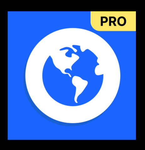
Bucks: For Converting Currencies