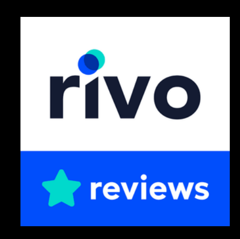
Rivo: For Creating Loyalty and Rewards