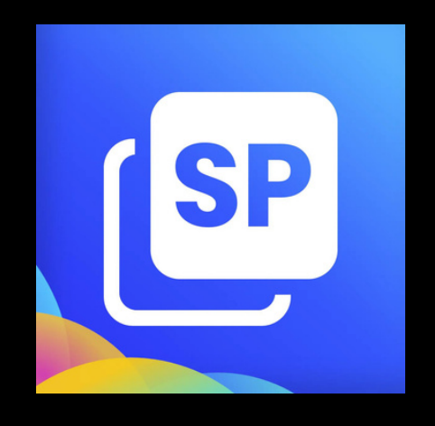
SalesPop: For Sales Popups That Convert